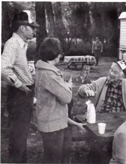
MEL KCØP and XYL