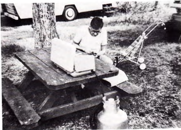
TIME FOR REPAIRS